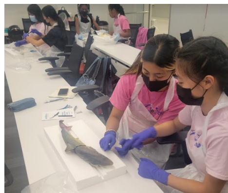
Dogfish Shark dissection