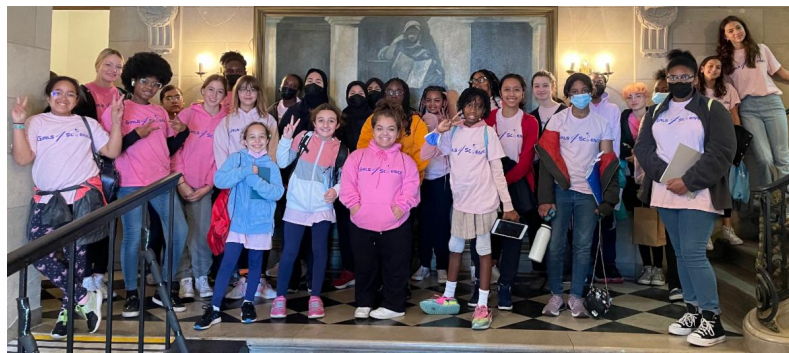
Girls 4 Science at the International Museum of Surgical Science

Representatives from Walgreens InclusivIT Resource Group, pharmaceutical company AbbVie and Malcolm X City College participated in a panel discussion on careers in pharmacy, work-life balance and the important role pharmacists play on the healthcare team. The panelists highlighted Pharmacy Technician training programs at City Colleges of Chicago, and the increased demand for pharmacists and pharmacy technicians in various practice settings.