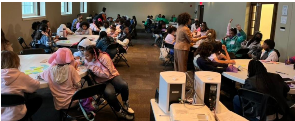
Girls 4 Science Leadership Workshop at the Glencoe Park District.

Farm Merrill Lynch, and the Rotary Club of Highland Park. The session concluded with a general session where the girls shared their aspirations and how they could grow to be leaders in the future. AbbVie donated the journals and pens for the workshop.